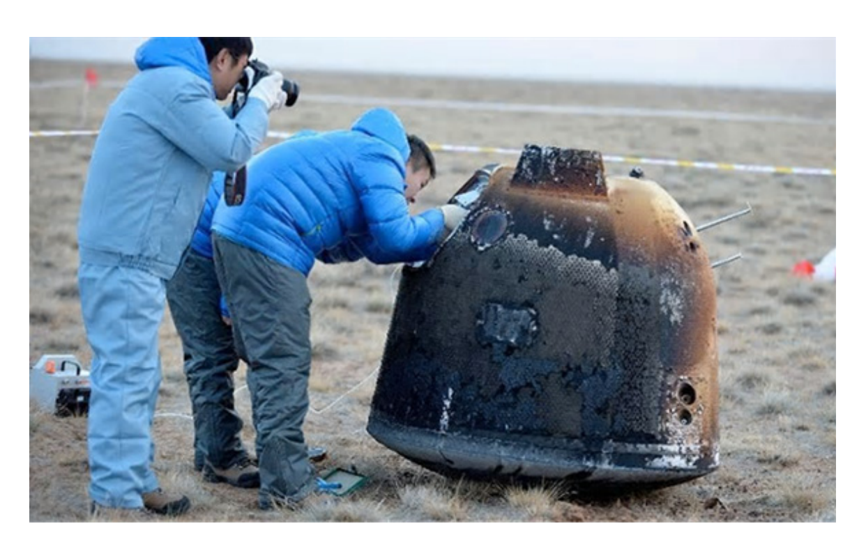
Figure 1. China probe flies around moon.

Journeys including humans to go beyond the earth, to new discoveries and to search for other living areas are right around the corner. Current example for this, Rosetta space duty performed with international cooperation by Europe Space Agency (ESA). Japan's Hayabusa2 space vehicle took on a similar duty and started its journey. USA continues to work on to send catch-bring meteors duty to space. China and India,