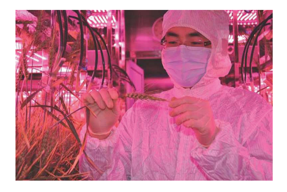
Figure 9. Dr. Chen Dong of Beihang University inspecting wheat plants inside the Lunar Palace 1 facility in Beijing, China. Note the pinkish colored light from high output red and white LEDs to grow the crops that supported three crew members for 105 days.