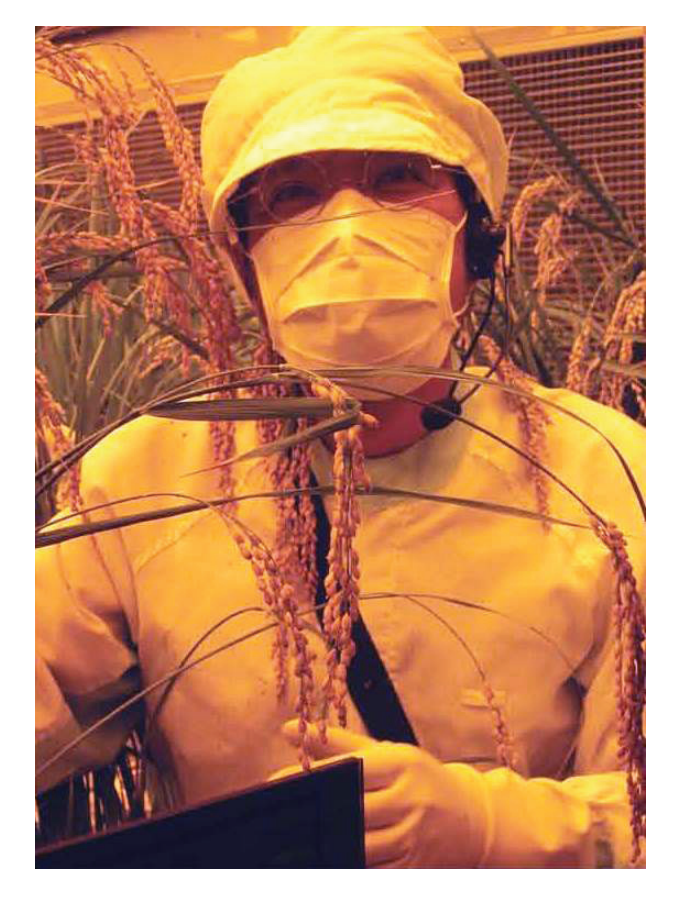
Figure 6. "Econaut" crew member of the Closed Ecological Experiment Facility (CEEF) team in Japan tending rice plants inside the facility (2007). Two Econauts and two miniature goats lived inside the facility for periods of up to 4 weeks, where ful5l life support, including a near-complete diet was provided by plants. Notice the yellowish orange light from the high-pressure sodium lamps used for crop light.

In addition to the humans, two miniature goats were enclosed in the system and were fed inedible